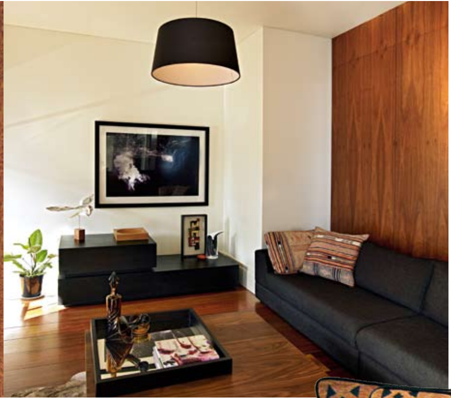
WORDS & SOURCING BY KERRYN RAMSEY

Brushbox veneer wall panelling adds warmth in the home while mirroring the timber steps – also in brushbox. When hanging timber veneer, care must be taken to align joints perfectly, as they cannot be covered and painted. Check out Laminex's Natural Timber Veneer in Brushbox (one of a range of 90), from $72 per sqm; call 13 21 36 or visit www.laminex.com.au .